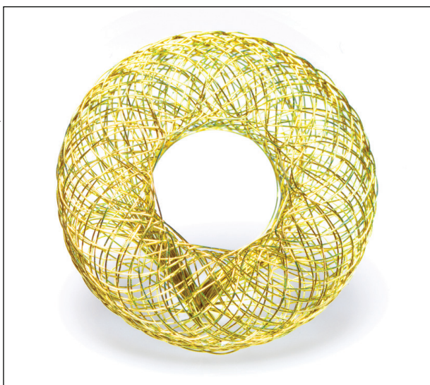
Figure 3. The AFR device.